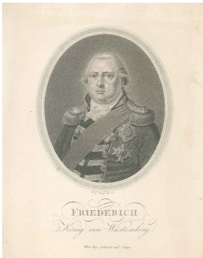
King Friedrich II.