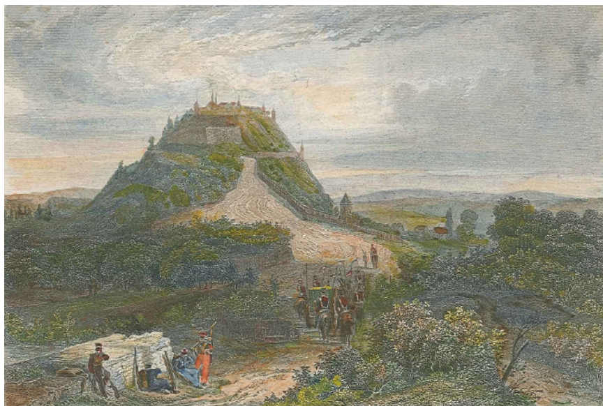
A late-nineteenth century painting of the fortress Hohenasperg where about sixty Separatists were imprisoned, some for as long as twenty years. In the foreground is a group of prisoners guarded by soldiers.

the Fortress which meant that they also were forced to work there. All over Wuerttemberg, about sixty men were arrested and sent to the Fortress of Hohenasperg. Their home villages had to pay for them if they were not able to work. You can imagine what they thought of their radical citizens who caused so much costs and trouble.