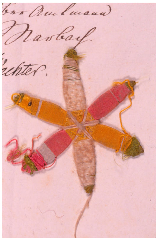
A Separatist star, the only one known to exist in Wuerttemberg. It is attached to a document in the Hauptstaatsarchiv Stuttgart.

A 213 Bü 3091.