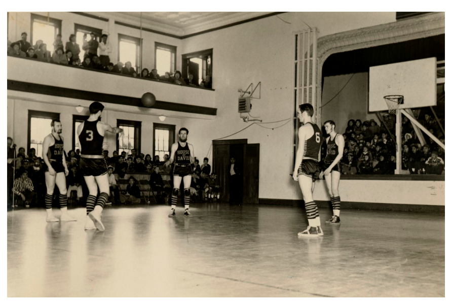
House of David players in their pre-game warmup.