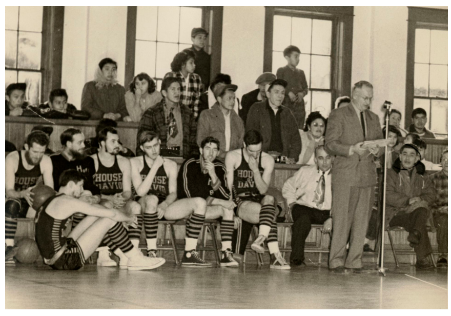
Pre-game introductions and speeches.